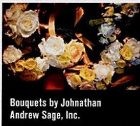
Bouquets by Johnathan Andrew Sage, Inc.