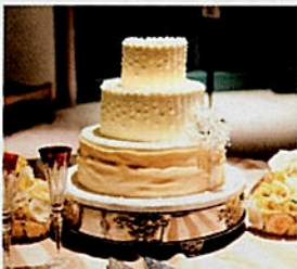
A buttercream confection by Rustika Café & Bakery