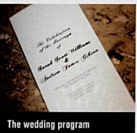
The wedding program