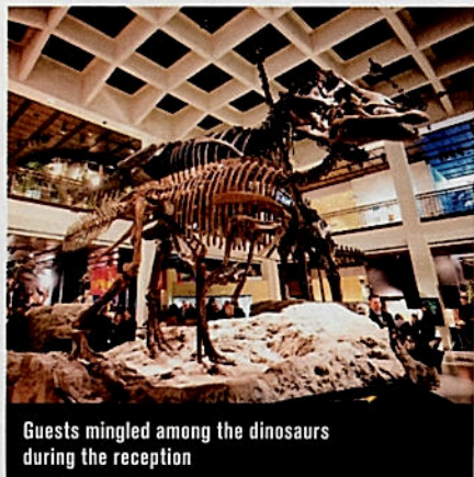
Guests mingled among the dinosaurs during the reception